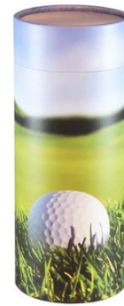
#PI – NH or NHM The 19 th Hole