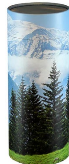
#PI – RP or RPM Rainbow Pond

Scattering tubes are durable, dignified and simple to use.