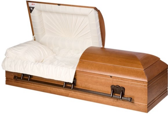
The Carter (Light Walnut) by Northern Casket #228LW 100% Ontario solid poplar Stonecoat satin finish Rosetan crepe interior Sunburst head panel

All caskets listed are "Adult" caskets. Youth and Plus Size caskets are available and further information and pricing is available upon consumer request.