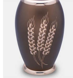
Prairie Wheat $400.00 by Commemorate Group #A131 Brass, 208 cubic inches, threaded top 6.1" x 6.1" x 9.84"