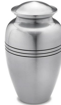
Radiance Pewter $325.00 by Commemorate Group #A215 Alloy, 205 cubic inches, threaded top 6.3" x 6.3" x 10.43"