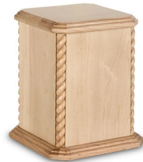
Contemporary Urn $450.00 by North Urn #NU206 Cherry or Maple, 186 cubic inches 10" x 8" x 8"