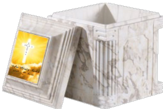
Aegean by Haberer Interment Services

Cremation vaults not only protect the cremated remains of your loved one but they also allow for special items to be placed with the cremated remains at the time of the interment.