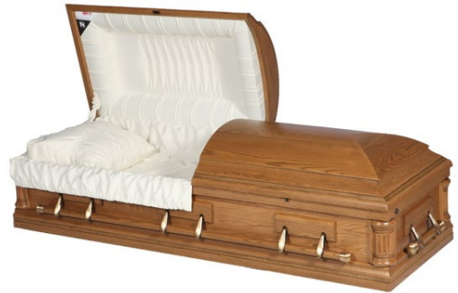
The Brunswick by Northern Casket #651 100% Canadian solid oak Stonecoat satin finish Rosetan crepe interior Vertically piped head panel