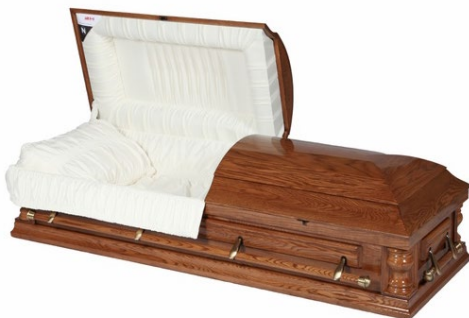
The Parham by Northern Casket #658 100% Canadian solid oak Triple coat, gloss finish Rosetan crepe interior Vertically piped head panel **Canadian Heritage Series corners and panel**