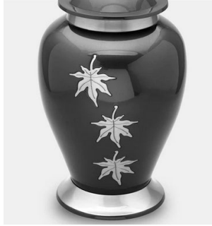
Autumn Leaves Midnight $350.00 by Commemorate Group #A125 Alloy, 196 cubic inches, threaded top 6.57" x 6.57" x 10.51"

Further information, options and pricing is available upon consumer request.