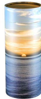
#PI – MV or MVM Mountain View