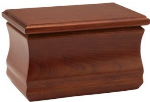
Cherry Signature Urn $450.00 by North Urn #NU213 Cherry, 206 cubic inches 10.4" x 7.25" x 6.12"