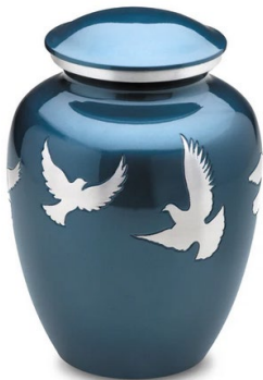
Divine Flying Doves $350.00 by Commemorate Group #A572 Alloy, 214 cubic inches, threaded top 6.89" x 6.89" x 9.84"