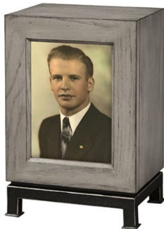
Metro Mantel Chest Urn $525.00 by North Urn #HM800-204 Hardwood, 275 cubic inches, holds a 5 x 7 photo 7.75" x 6" x 11.5"