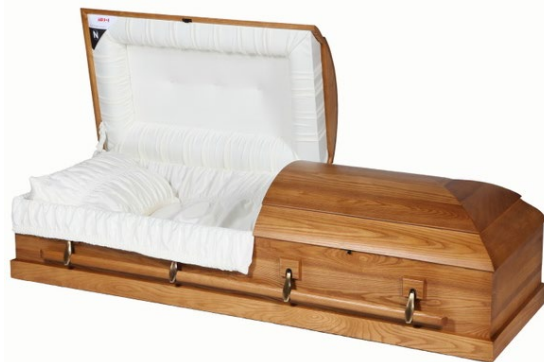
The Glentay by Northern Casket #444 100% Canadian solid oak Stonecoat satin finish Rosetan crepe interior Button head panel