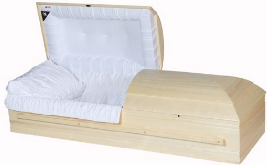
The Carter (Natural) by Northern Casket #228N 100% Ontario solid poplar Stonecoat satin finish Rosetan crepe interior Button head panel