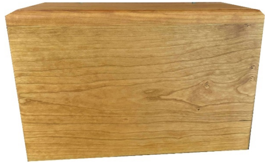
Desman's Cherry $400.00 by Desman's Landing Creations #DLC - C Locally sourced solid cherry, 240 cubic inches, hard wax finish 11.5" x 5.5" x 7.5" **engraving not available**