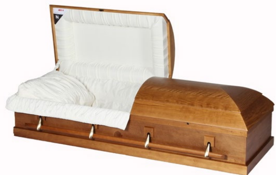
The Morden by Northern Casket #446 Poplar veneer sides/solid poplar top and mouldings Stonecoat satin finish Rosetan crepe interior Plain head panel