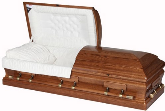
The Windermere by Northern Casket #960 100% Canadian solid oak Triple coat, gloss finish Toast velvet interior Buntuffed panel

All caskets listed are "Adult" caskets. Youth and Plus Size caskets are available and further information and pricing is available upon consumer request.