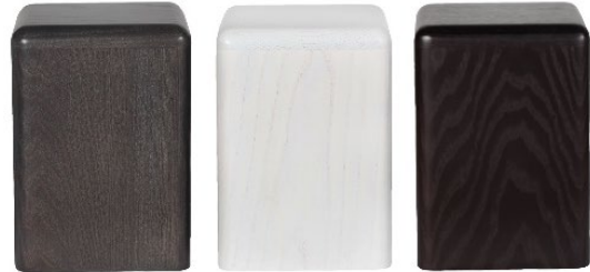
Ember Urn $300.00 by North Urn #NU201 Ash, 200 cubic inches Available in painted grey, white or black 9" x 6.5" x 6.5"