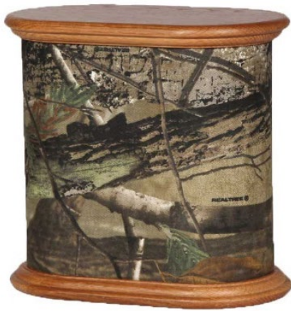
Camo Tambour Urn $425.00 by North Urn #NU212 Oak top and bottom, cloth camo material, 282 cubic inches 9.5" x 5.75" x 9.5"

Further information, options and pricing is available upon consumer request.