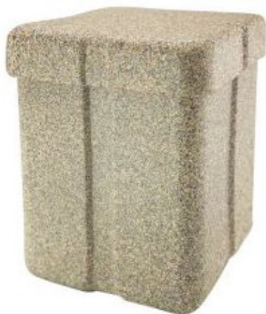
Sandstone by Victoriaville #G0000-20023 Polyethylene with a sandstone finish