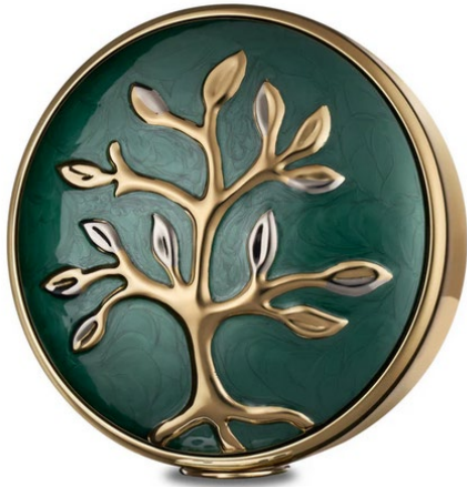
Tree of Life $800.00 by Commemorate Group #A1100 Brass, 428 cubic inches, threaded screw on bottom 5.91" x 11.22" x 11.42" **could be used as a companion urn**

Further information, options and pricing is available upon consumer request.