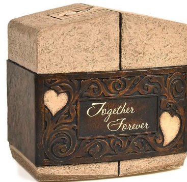
Together Forever Companion Urn $800.00 by RK Productions #EA1007-E Stone, Canadian made, 420 cubic inches, bottom load 9.75" x 7.5" x 9.75"