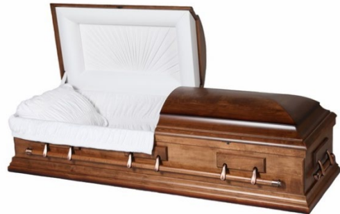
The Cameron by Northern Casket #702 100% Canadian solid maple Triple coat, gloss finish Rosetan velvet interior Sunburst head panel