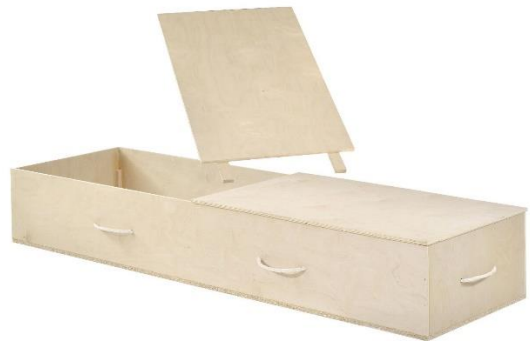
The Glencove by Victoriaville #CR879-00033 Solid select wood Natural maple woodgrain White crepe interior