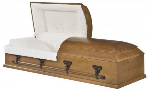
The Puma by Victoriaville #WR252-00180 Poplar and veneer 1" stock timber and 5/8" material Beige crepe interior