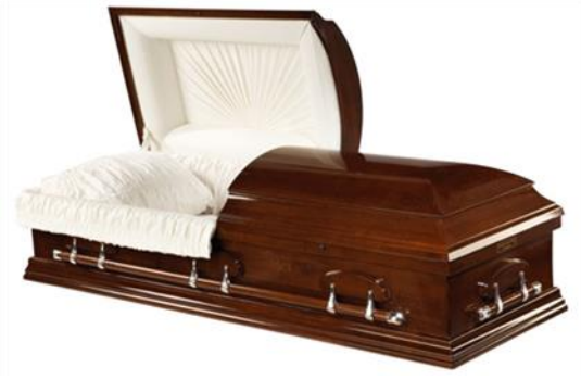
The Dominion by Victoriaville #WR220-00379 Maple 1" stock timber Tan crepe interior