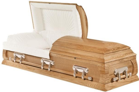
The Digby by Victoriaville #WR232-00429 Ash and Ash veneer, 1" stock timber and 5/8" material Tan crepe interior

All caskets listed are "Adult" caskets. Youth and Plus Size caskets are available and further information and pricing is available upon consumer request.