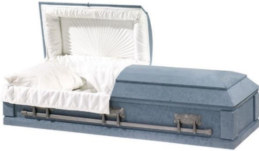
The Lester by Victoriaville #DR220-00043 MDF 5/8" material Blue cloth exterior White satin interior