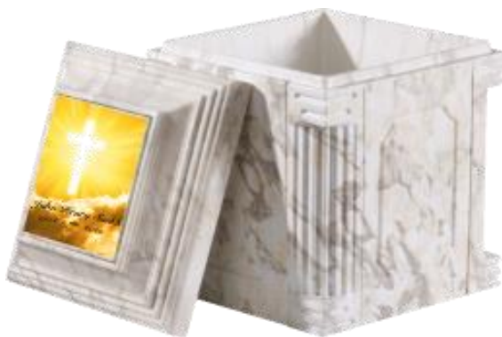
Aegean by Haberer Interment Services

Cremation vaults not only protect the cremated remains of your loved one but they also allow for special items to be placed with the cremated remains at the time of the interment.