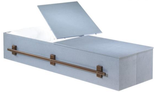
The Hampton by Victoriaville #DR520-00033 MDF 5/8" material Gray cloth exterior White silk interior