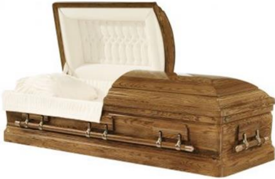
The Parliament by Victoriaville #WR210-20848 Red Oak 1" and 2" stock timber Ivory velvet interior

All caskets listed are "Adult" caskets. Youth and Plus Size caskets are available and further information and pricing is available upon consumer request.