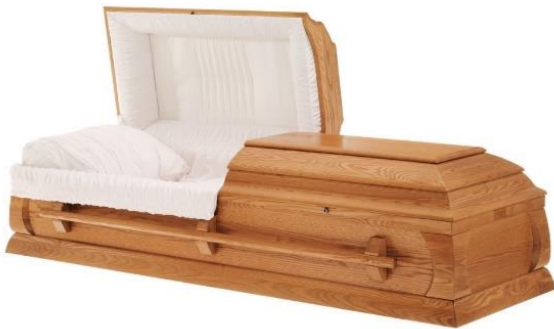
The Ashton by Victoriaville #WR232-00418 Ash and veneer 1" stock timber and 5/8" material Beige crepe interior