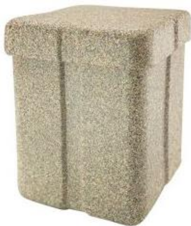
Sandstone by Victoriaville #G0000-20023 Polyethylene with a sandstone finish