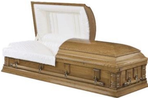
The Simcoe by Victoriaville #WC212-00002 Red Oak 1" stock timber Tan crepe interior **Interchangeable corner option available**