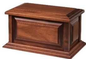
Allen by Victoriaville #US120-00003 Solid Maple Urn

**If you are planning to place the urn at a columbarium you will need to select an urn that is suitable in size for this to take place**