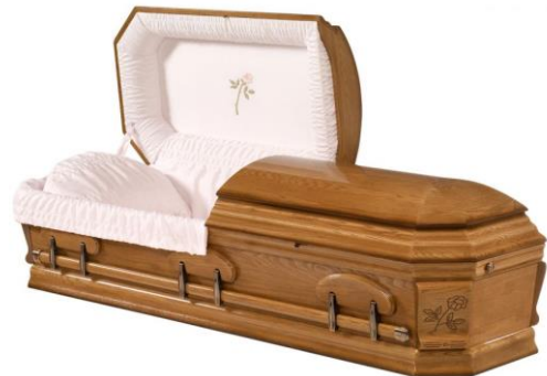
The Fairholme by Victoriaville #WR210-00195 Red Oak 1" stock timber Dusty pink crepe interior