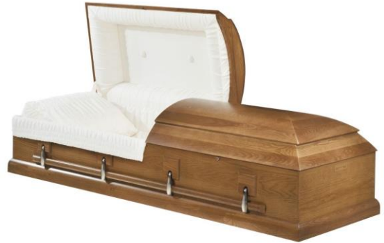
The Borealis by Victoriaville #WR232-00359 Ash and veneer 1" stock timber Beige crepe interior