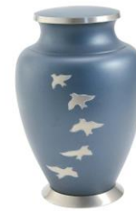
Aria Ascending Fullsize Urn by Victoriaville #US440-00449 Metal Urn